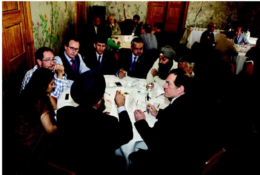
Participants at the 'Meeting of the Minds' symposium in discussion.